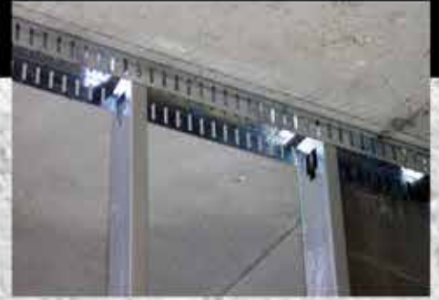
Deep Leg Track